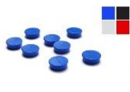
(MAGNETS) MAGNETS MAGNETE